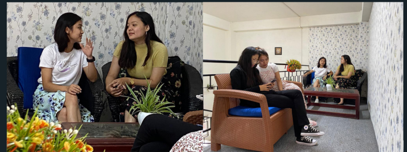
COMMON ROOM FOR WOMEN