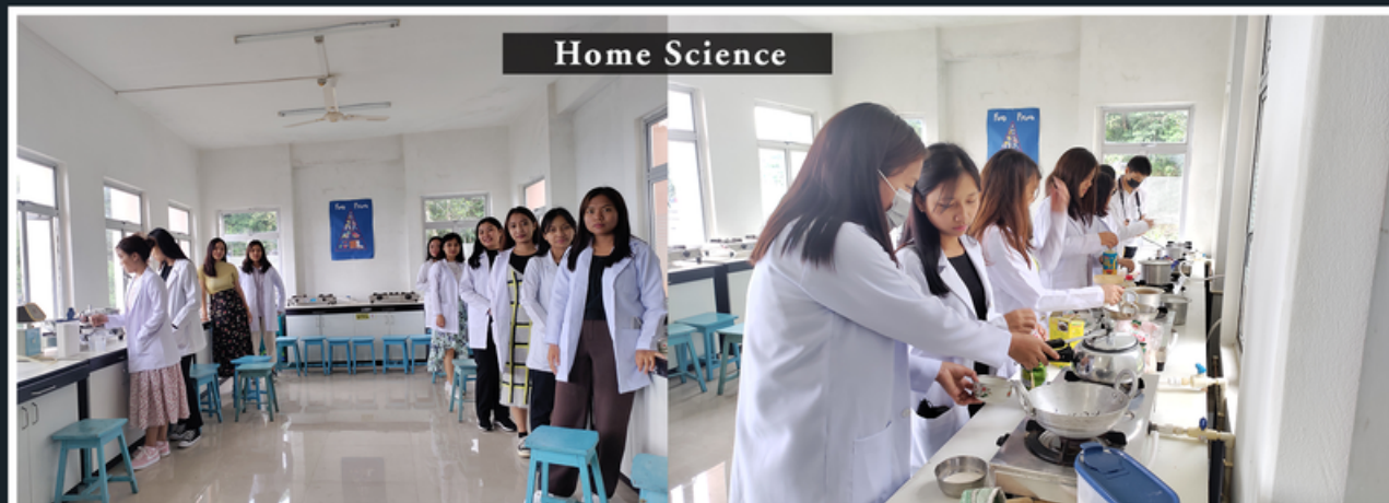
PHOTO OF PRACTICAL WORKS