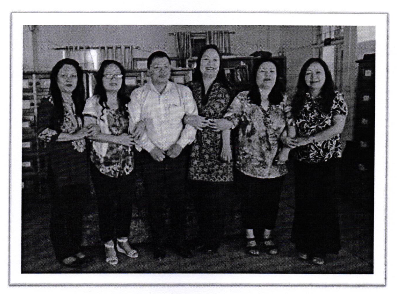
Some of the happy participants taking photo with Resource Person.

The session was ended with some homework because the resource person wanted to make sure that most of the participants must be well versed in the digital teaching methods which he presented both in theory as well as in practical. The session was great and the interactions were so beneficial for the participants.