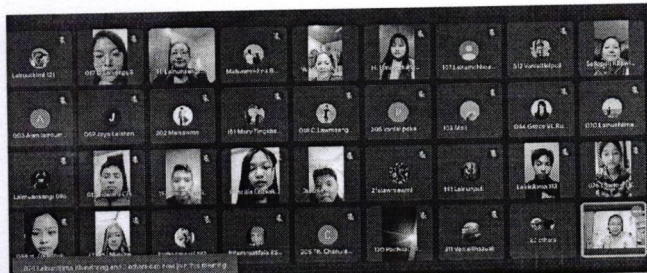
Pic-3: Some of the participants