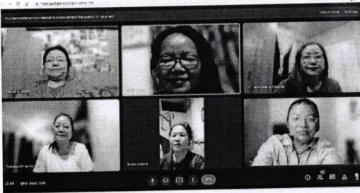
Pic-2: Some of the participating