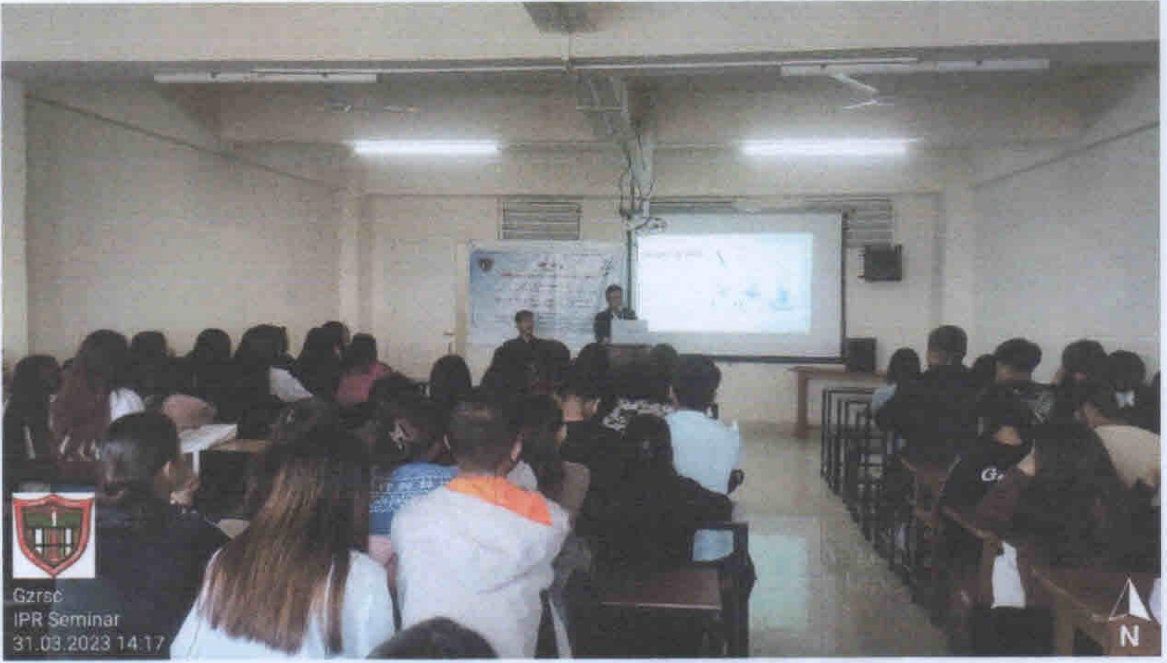
Govt. Zirtiri Residential Science College Aizawi : Mizoram