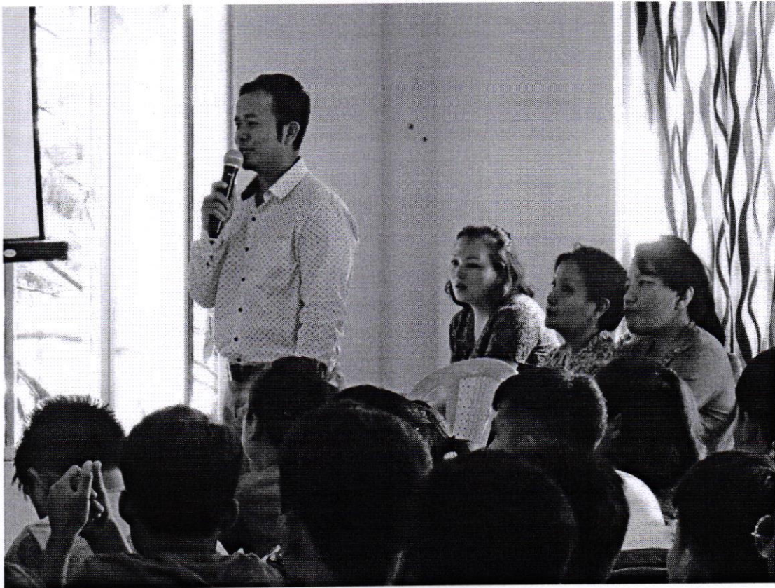
Pic 5: Question and answer session