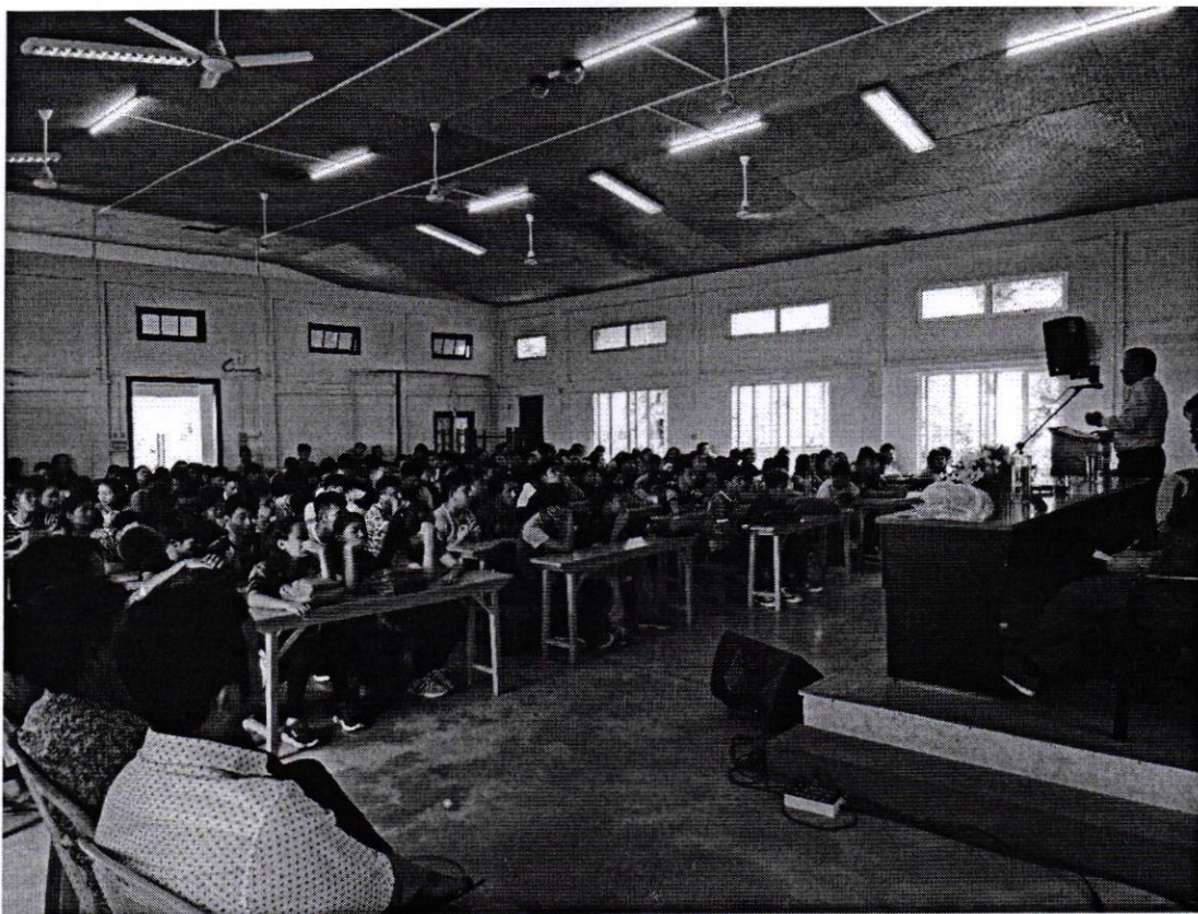
Pic 4: Students of GZRSC