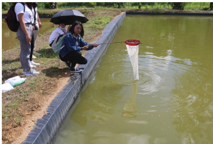
Figure 1 Collecting phytoplankton