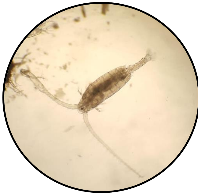
Under Microscope High magnification