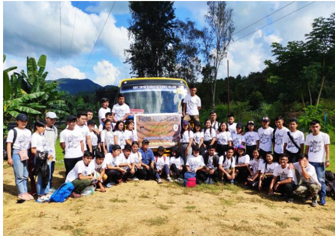
Fig.1 V Sem B.Sc (Zoology) Fish Seed Farm , Thenzawl