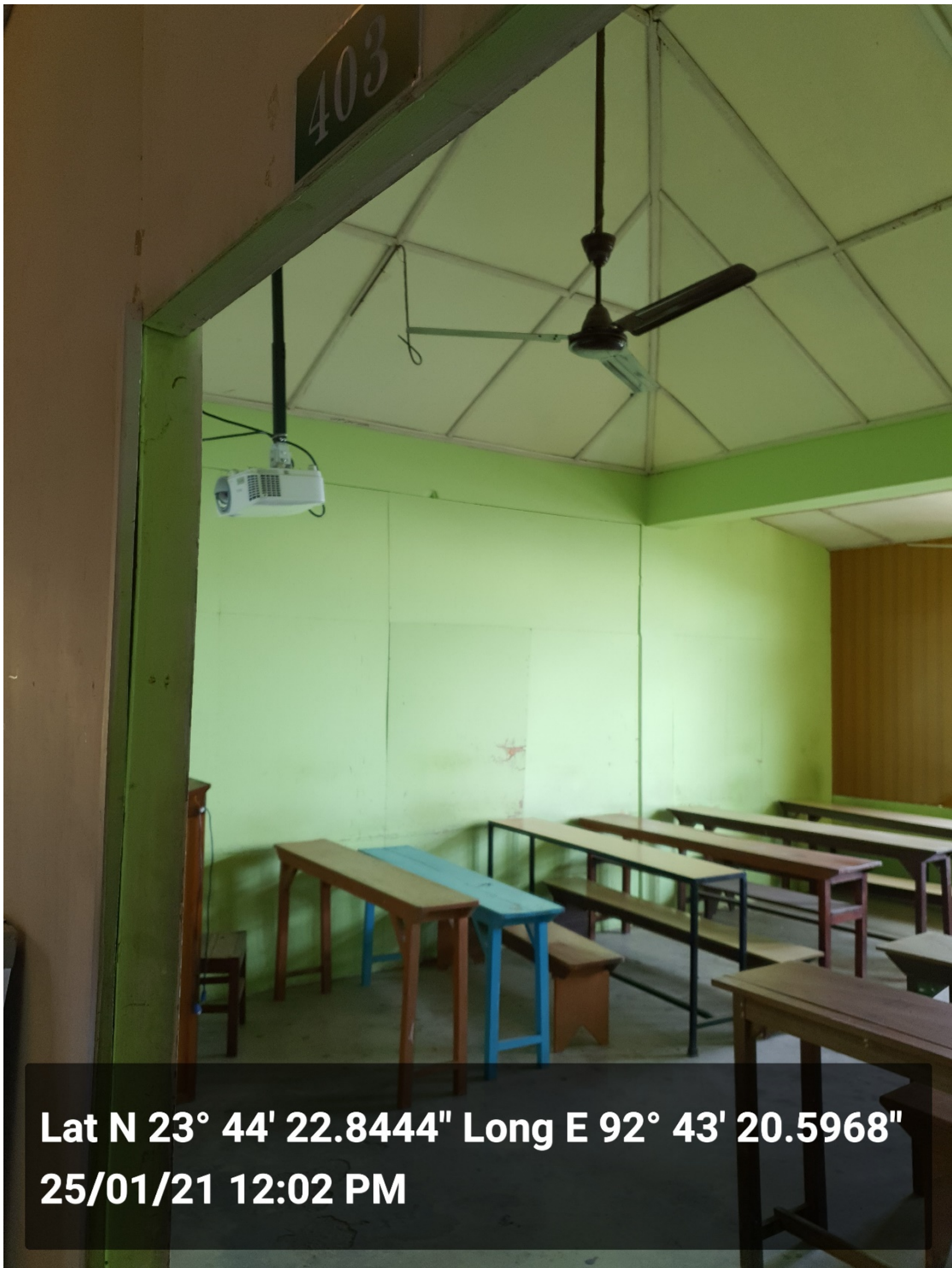
403 – 3 & 4 th Sem BCA Room