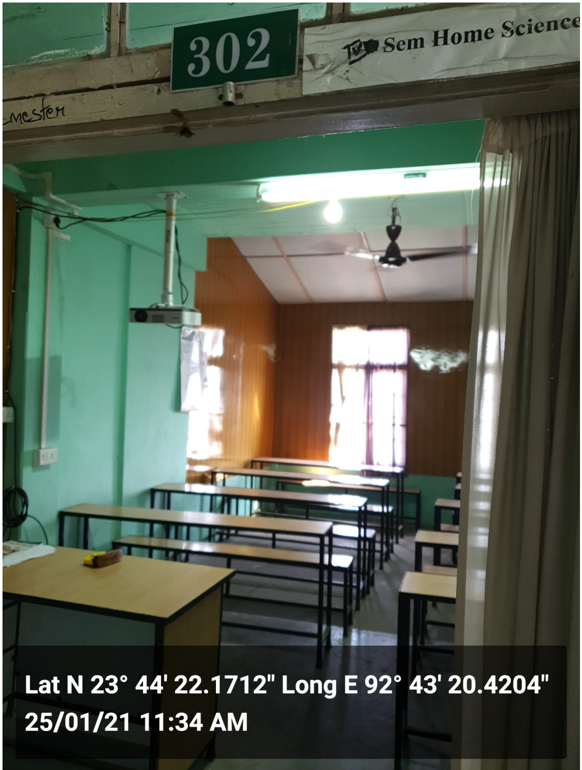
302 – 3/4 Sem Home Science Room