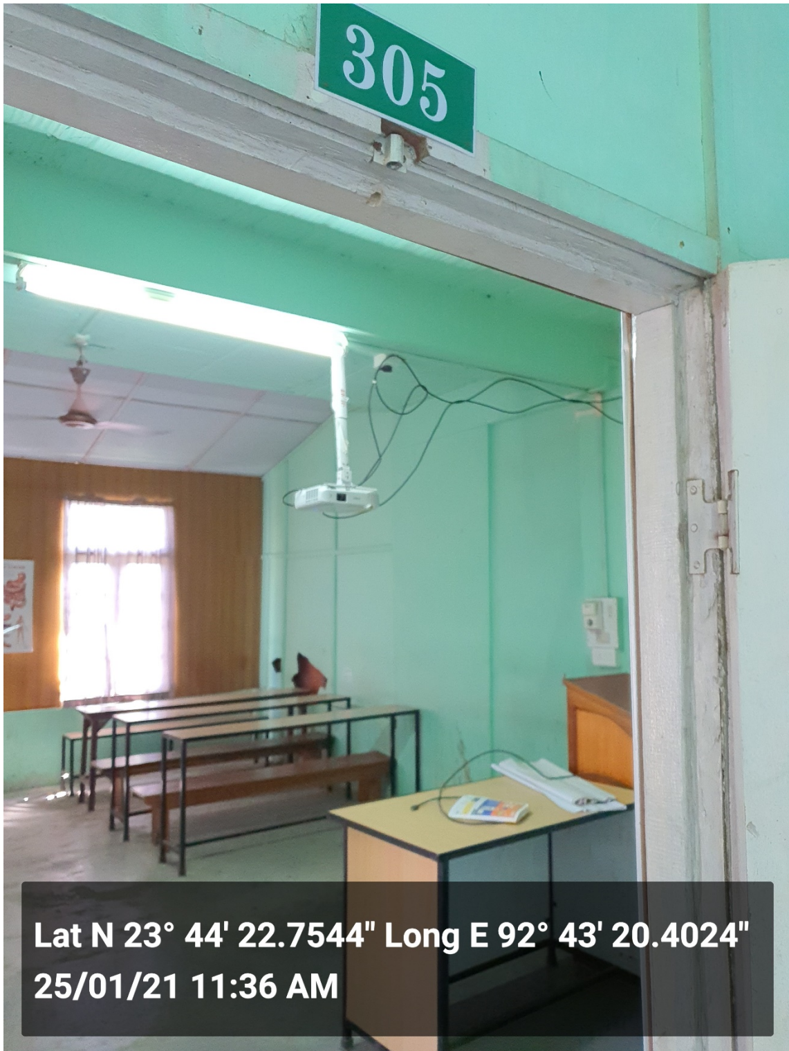
305 – Biochemistry Room