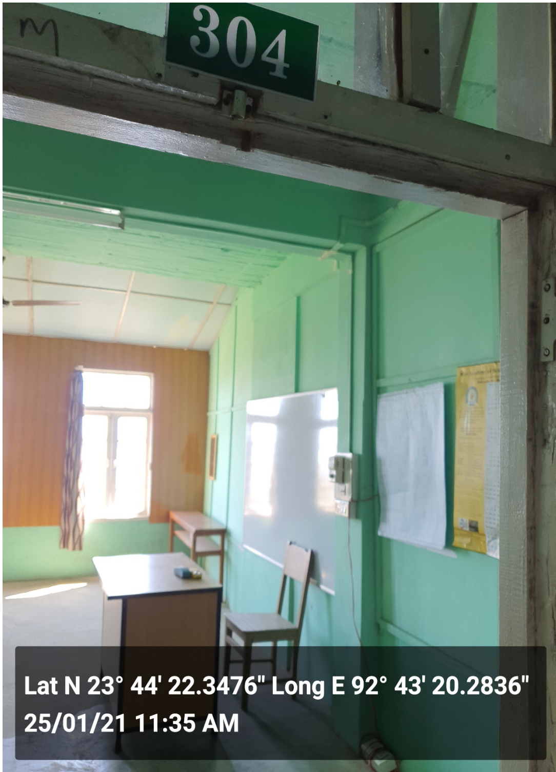
304 – 5/6 Sem Home Science Room