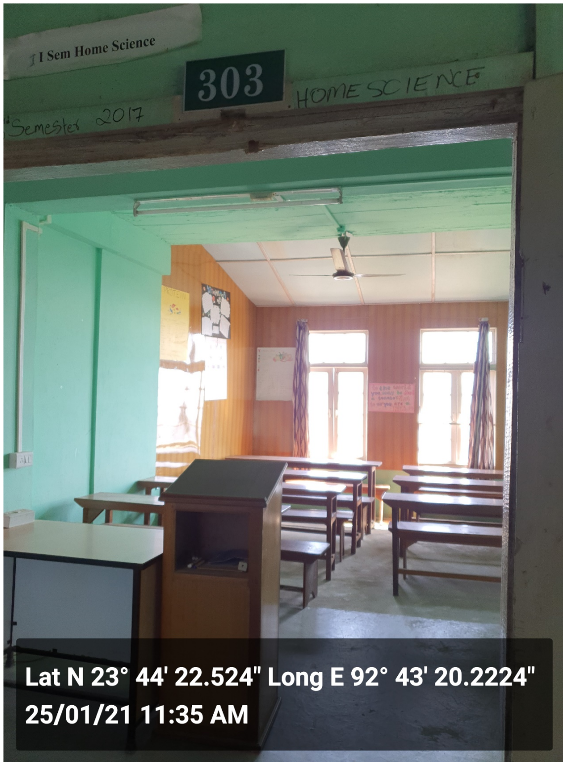
303 – 1/2 Sem Home Science Room