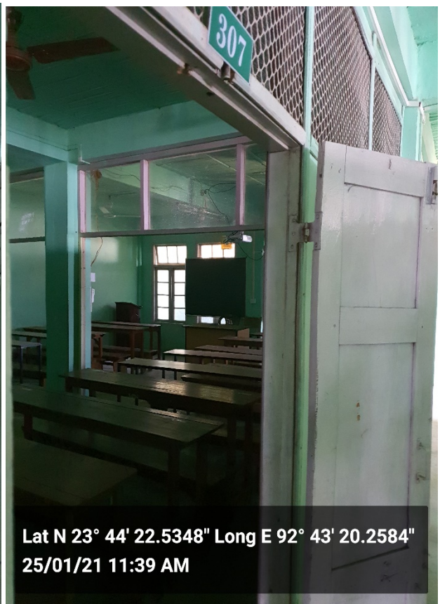
306 & 307 – 3/4 Sem Physical Science Room