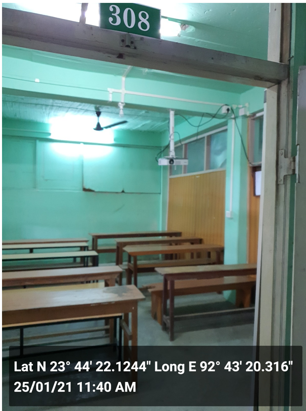
308 – Chemistry Core Room