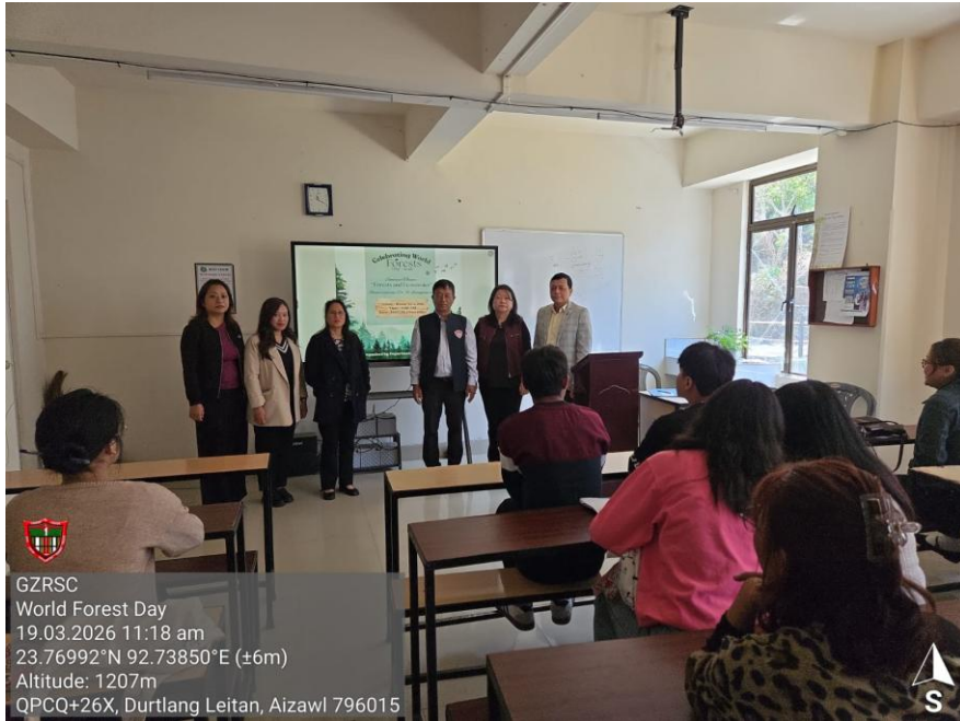
GZRSC World Forest Day 19.03.2026 11:18 am 23.76992°N 92.73850°E (±6m) Altitude: 1207m QPCQ+26X, Durtlang Leitan, Aizawl 796015