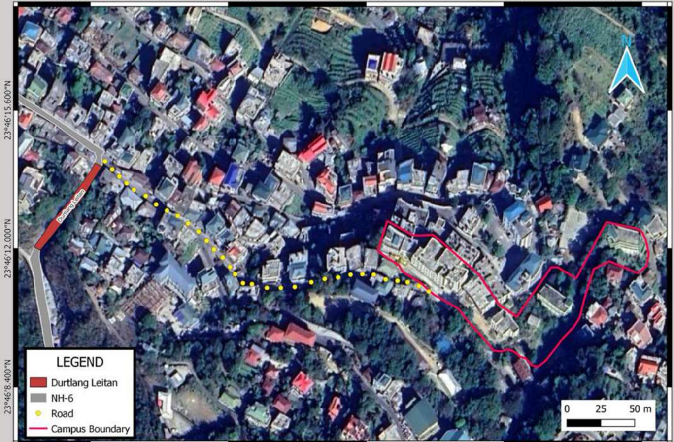
LOCATION MAP OF GOVT. ZIRTIRI RESIDENTIAL SCIENCE COLLEGE