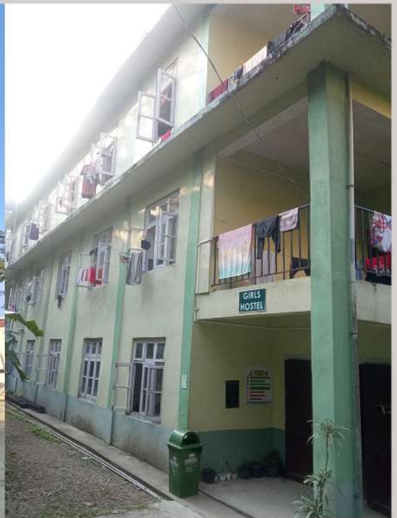
BOYS AND GIRLS HOSTEL @ DURTLANG CAMPUS