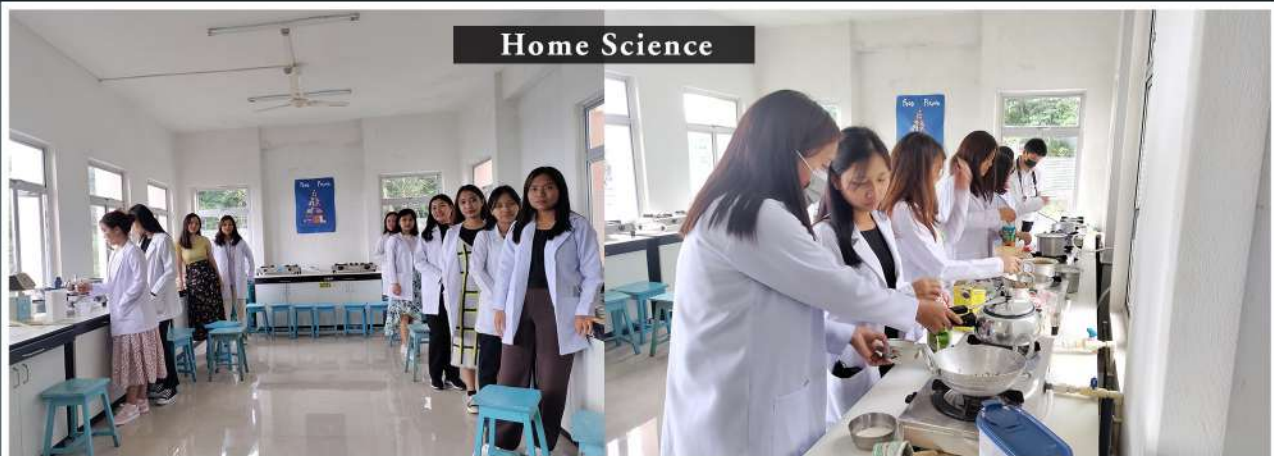
PHOTO OF PRACTICAL AND SKILL ENHANCEMENT CLASS