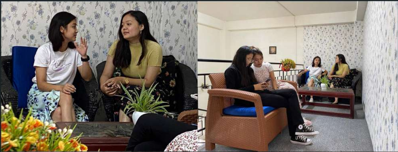
COMMON ROOM FOR WOMEN